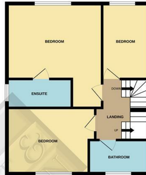
1ST FLOOR 569 sq.ft. (52.9 sq.m.) approx.